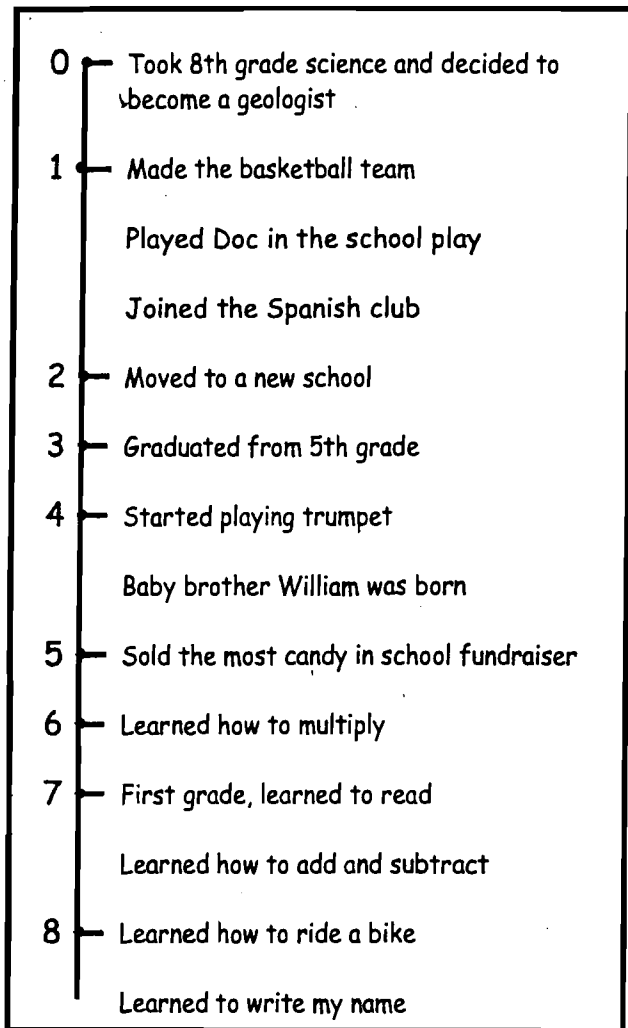
Brent's time line